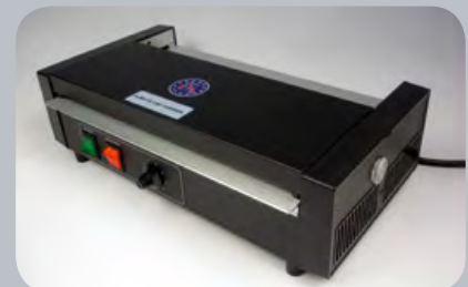
12" Laminator (690)

Davies Enterprises Ltd. 114 Chain Lake Dr., Halifax, NS B3S1B1 (902)450-5075 www.daviesenterprises.com