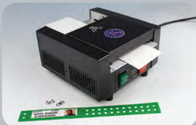
4" Laminator (698)

Clincher wristbands are most effective when used with recommended laminators and wristband sleeves: